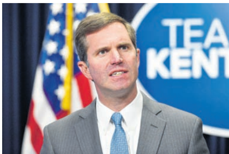
FILE - Kentucky Gov. Andy Beshear addresses reporters during a press conference in Frankfort, Ky., Nov. 15, 2022. Beshear’s veto of a bill aimed at transgender health care has put Kentucky in the middle of a national fight. But the consequences are more immediate in Kentucky. Its election this year offers an early test on the state-by-state assault on gender-affirming care for minors. The veto issued Friday set off competing messages likely to be repeated until the November election.

State and local fire investigators are continuing to examine the scene to try to determine the cause of the blast. □